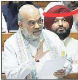
Home Minister Amit Shah speaks in the Lok Sabha during the Budget session of Parliament in New Delhi.

He said there has been no violence in Manipur in the last four months, adding that talks were