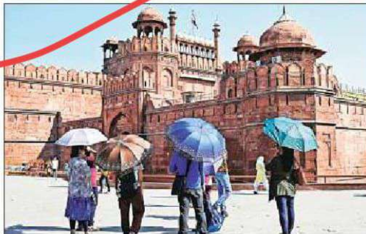
People resort to umbrellas under the blistering sun at Red Fort in New Delhi on Monday.

"From April to June, most parts of north and east India, central