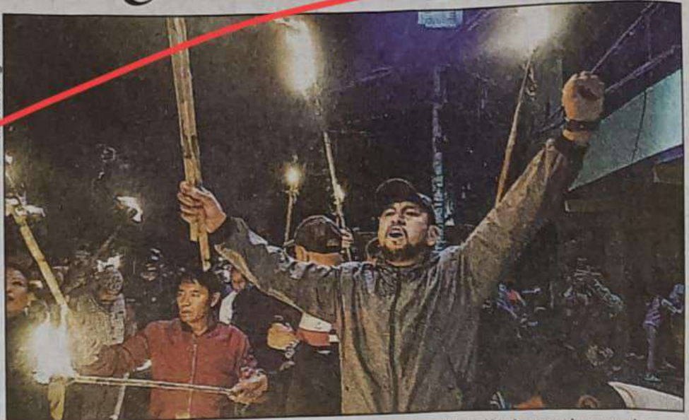
Pro-monarchy protesters carried out 'mashaal' rally in Kathmandu (above) and 11 other cities to condemn the arrests of their members

Meanwhile, during a session of the federal parliament on Monday, lawmakers from the ruling coalition demanded that former king Gyanendra