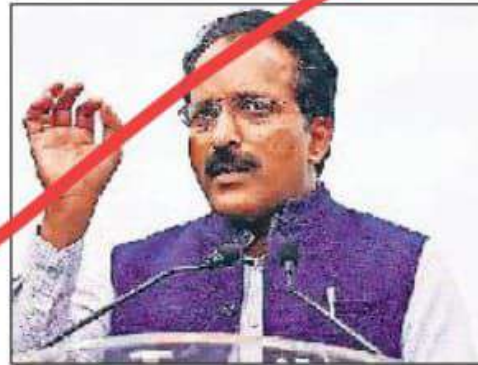
Former ISRO chairman S Somanath

Addressing the 60th annual convocation of the Indian Institute of Management Ahmedabad on Saturday, Somanath also emphasised the need for a connection between research organisations, academia and industry, which he, however, added remained a "distant dream". "On this occasion, I would like to highlight the rich and glorious knowledge tradi-