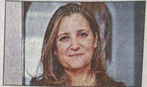
Chrystia Freeland, 56, the former FM whose resignation triggered Trudeau's decision to step down

and former member of parliament, is also running.