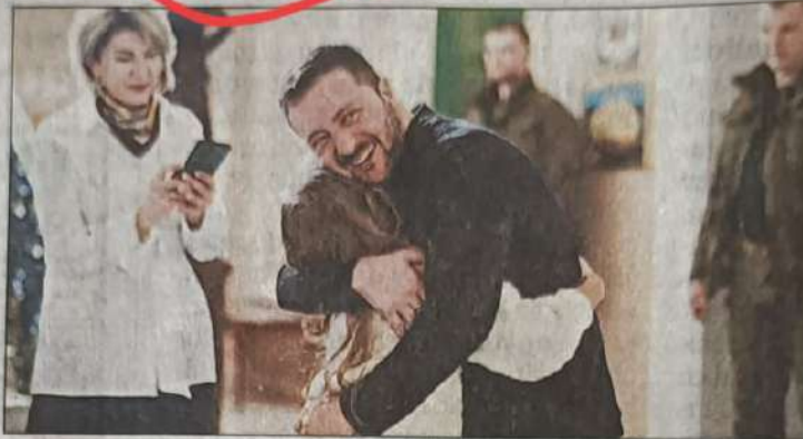
President Zelensky quipped about his attire on Sunday, in apparent reference to his spat with Trump. Concluding his speech at an event in Kyiv on Sunday, he joked, 'Sorry I'm not in a suit', earning applause