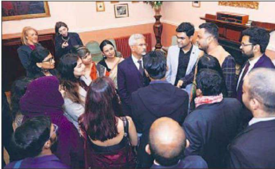
External Affairs Minister S Jaishankar meets Chevening Scholars from India, at the Chevening House in London. (PTI)