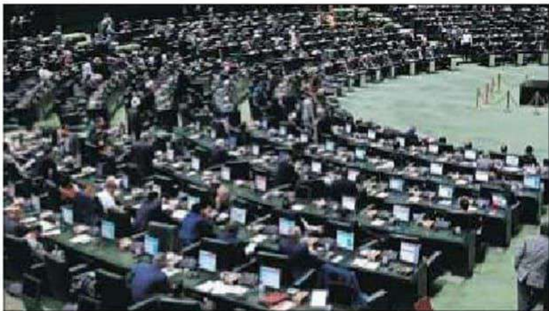
Iranian Parliament holds an impeachment hearing of the Economy Minister Abdolnasser Hemmati in Tehran on Sunday.