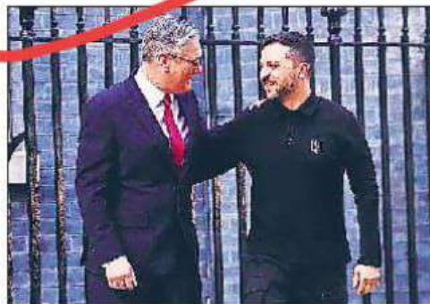
British Prime Minister Keir Starmer with Ukrainian President Volodymyr Zelenskyy

But Starmer said he's focused on being a bridge to restore peace talks, whose collapse he used as an opportunity to re-engage with Trump, Zelenskyy and French President Emmanuel Macron rather than "ramp up the rhetoric."