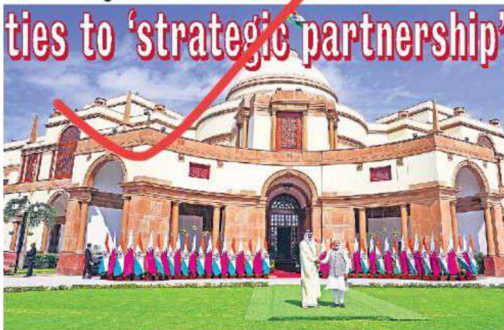
Prime Minister Narendra Modi and Amir of Qatar Sheikh Tamim Bin Hamad Al Thani shake hands before a meeting at Hyderabad House, in New Delhi, on Tuesday.