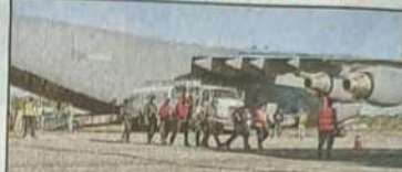
Guatemalan migrants return on a US military plane on Jan 24