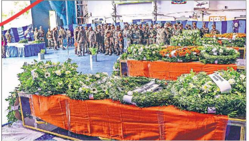
The mortal remains of four Army personnel who were killed in an encounter with terrorists in Jammu and Kashmir's Doda district, in Doda, on Tuesday.

Gandhi also said such horrific incidents one after the other are extremely