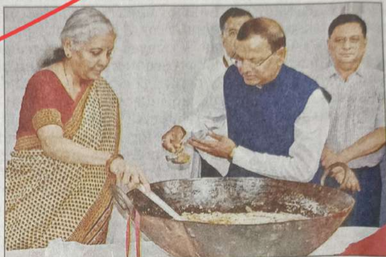
HALWA CEREMONY: FM Nirmala Sitharaman with her deputy Pankaj Chaudhary and top officials at the Halwa ceremony on Tuesday. After the ceremony, several employees stay inside the press till the Budget is presented in Parliament

IMF's projections are in line with govt's estimates but lower than RBI's revised forecast of 7.2% for the current financial year. Govt may revise its projections when FM Nir-