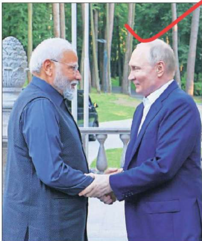
Prime Minister Narendra Modi welcomed by Russian President Vladimir Putin at his official residence at Novo-Ogaryovo for a private engagement, in Moscow, Russia, on Monday.

■ President Putin hosts Prime Minister Narendra Modi at his official residence at Novo-Ogaryovo for a 'private engagement'