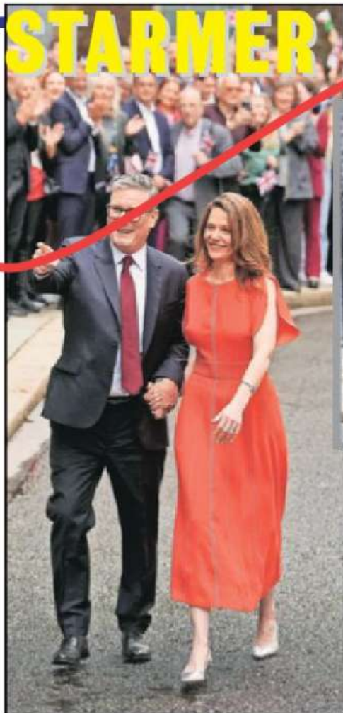
Britain's Labour Party Prime Minister Keir Starmer and his wife Victoria arrive in Downing Street and greet supporters in London on Friday.

"Our country has voted decisively for change, for national