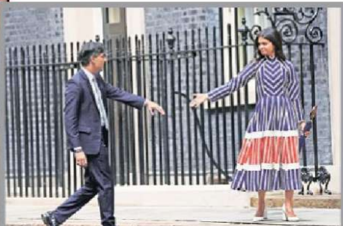
Outgoing Prime Minister Rishi Sunak and his wife Akshata Murty.