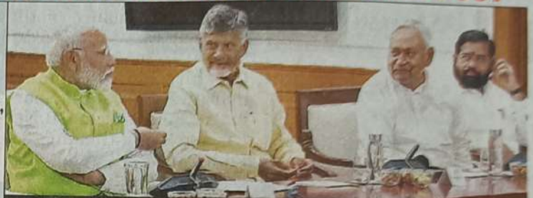
PM Modi with (L-R) TDP chief Chandrababu Naidu, Bihar CM Nitish Kumar & Maharashtra CM Eknath Shinde on Wednesday

► Chandrababu Naidu's TDP, which has 16 MPs, is learnt to have sought at least 2 berths