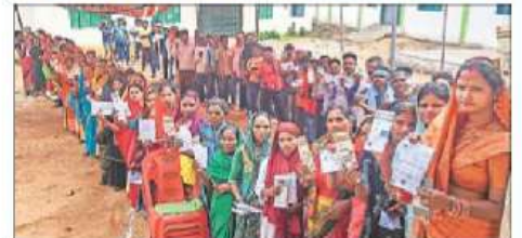
(Top) A family shows their inked-finger in Dewas, MP. (Above) People wait in queues to cast their votes in Khunti, Jharkhand.

Srinagar constituency witnessed 37.98% voting, with EC stating that it was the "highest turnout in decades"