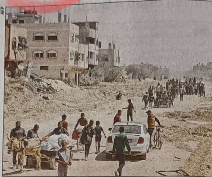
Palestinians who had taken refuge in Rafah leave the city on Sunday to return to Khan Younis after Israel pulled its ground forces out of the southern Gaza Strip. The withdrawal means troop presence in the territory is at one of the lowest levels since the six-month war began

Israel has placed its military on high alert and mobilised additional air defence units. Israeli combat soldiers expecting to go on leave over the weekend were also ordered to remain at their stations. The US is also on high alert for a possible attack by Iran targeting Israeli or US assets in the region. AGENCIES