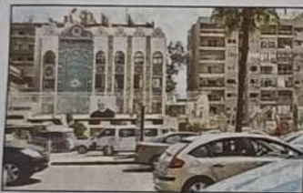
The Iranian embassy in Damascus

Iran's semi-official ISNA news agency published a graphic on Sunday that it said show-