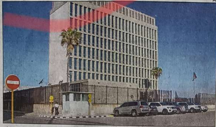
The US embassy in Havana. The report said the first incident of 'Havana Syndrome' symptoms may have happened in Frankfurt when a US govt employee stationed at the consulate there was knocked unconscious by something akin to a strong energy beam

But Insider, a Russia-focused investigative media group based in Riga, Latvia, reported that members of a Russian military intelligence (GRU) unit known as 29155 had been placed at the scene of reported health incidents involving US personnel. The year-long Insider investigation in collaboration with US network CBS' 60 Minutes and Germany's