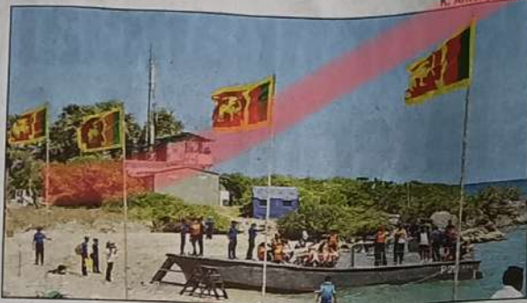
Jaishankar said people have a right to know how Katchatheevu was given to Sri Lanka and why even fishing rights were given up

"We know who did it but people of the country should be told who hid it. In May of 1961, PM Nehru wrote that he attaches no importance at all to this little island and he would have no hesitation in giving up claim to it. He