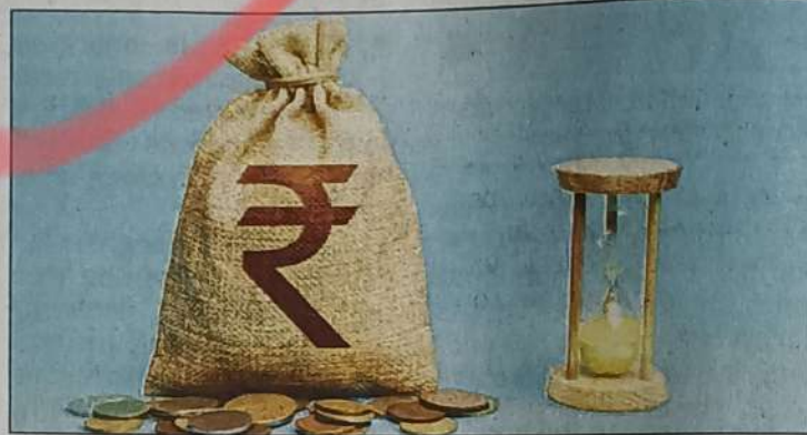
SC noted in its order that the state had already got substantial relief as the Centre agreed to release Rs 13,608 crore after the petition was filed

The apex court also noted in its order that the state