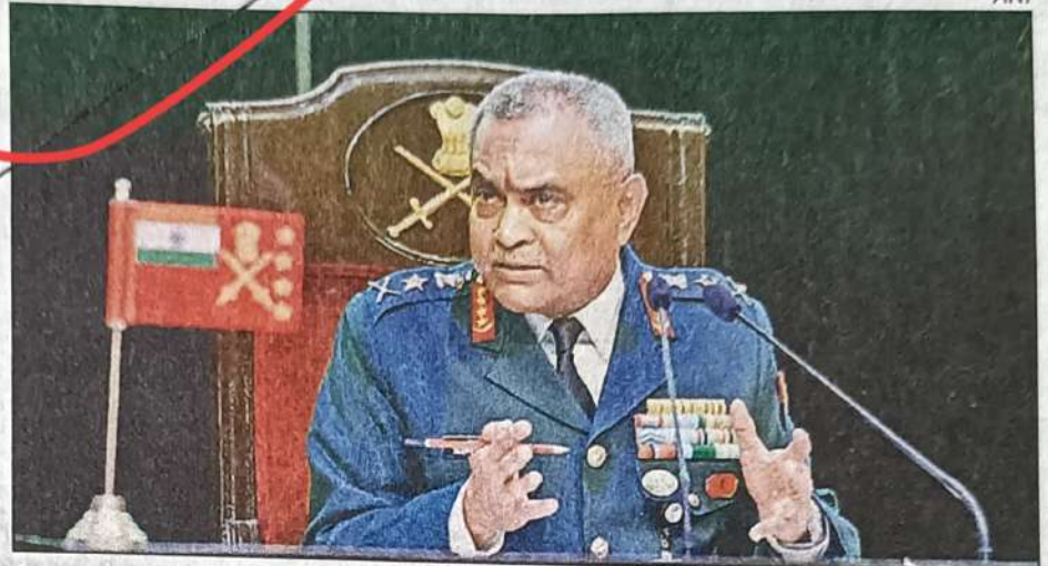
Gen Pande is also slated to visit several military establishments

India and US had discussed the joint manufacture of the eight-wheeled Stryker armoured infantry combat vehicles, which combine firepower with rapid mobility on the battlefield, during the two-plus-two ministerial dialogue on Nov 10. The plan is to