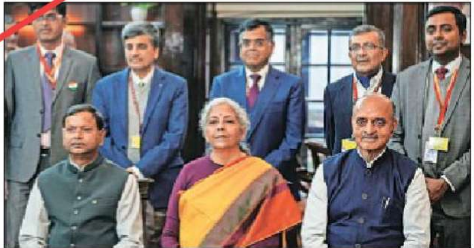
Union Finance Minister Nirmala Sitharaman with Ministers of State Pankaj Chaudhary and Bhagwat Karad and her team of officials a day before presentation of the Interim Budget 2024, at her North Block office in New Delhi on Wednesday.

With pressure for populist measures off after recent emphatic wins in three States,