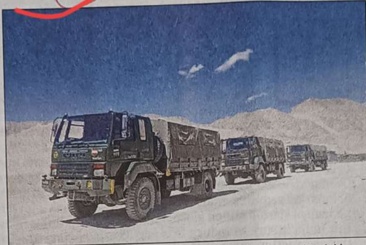
A file photo of army reinforcement in the border areas of Ladakh

According to a video of such an incident that surfaced on social media, undaunted graziers are seen resisting PLA soldiers who came at them accompanied by light armoured carriers. The incident is reported to have taken place on Jan 2, though TOI could not independently verify it. The incident has been re-