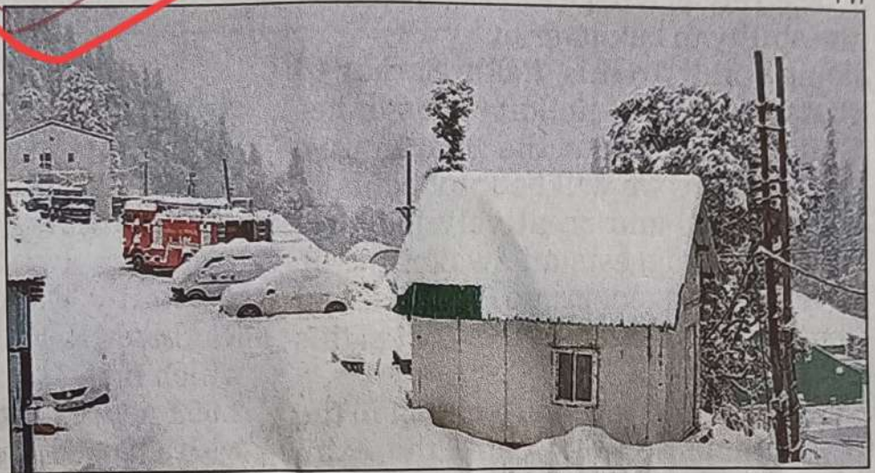
Manali covered in an envelop of snow after fresh snowfall on Wednesday

Releasing the monthly rainfall and temperature