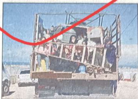
Palestinians flee Khan Younis in Gaza

Kata'ib Hezbollah is part of what is known as the Axis of