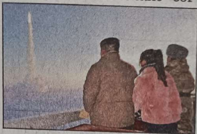
Kim Jong-un views the launch of a Hwasong-18 ICBM during what North Korea says is a drill in Dec

Seoul: North Korea fired around 200 artillery rounds on Friday near a disputed maritime border with South Korea in another escalation of tension between the rivals and prompting the South to take “cor-