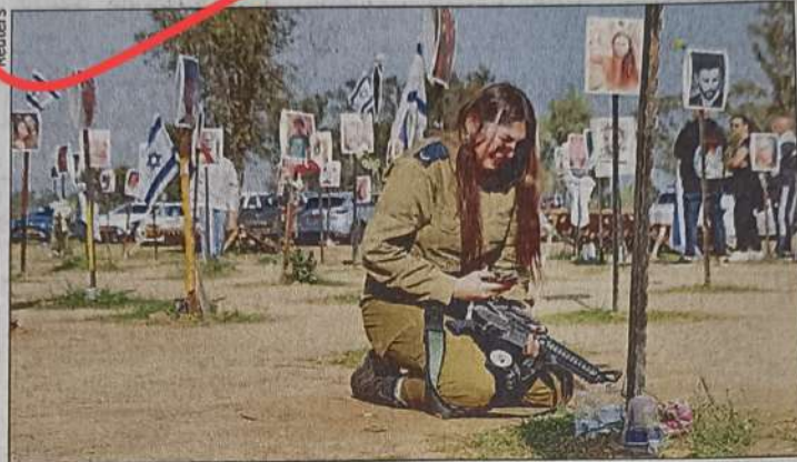
An Israeli soldier visits a memorial of her family at the site of the Nova festival where people were killed and kidnapped during the Oct 7 attack by Hamas

Gallant's proposal appeared to be an effort to stake out middle ground. It rules out involvement of the Palestinian Authority, which exercises authority in parts of the West Bank, in administering Gaza after the war. The Biden administration has called for the authority to play a postwar role