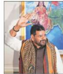
In suspending the newly elected WFI, the government cited its

Brij Bhushan's comments came soon after his meeting with BJP chief JP Nadda following Sports Ministry's suspension of the WFI till further orders.