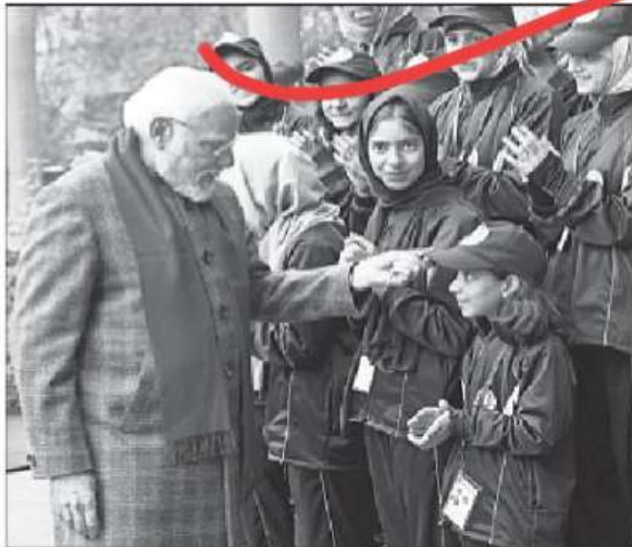
Prime Minister Narendra Modi interacts with a student from Jammu and Kashmir as part of their 'Watan Ko Jano' programme, in New Delhi on Sunday.

In the spirit of 'Ek Bharat Shreshtha Bharat', the visit was aimed at showcasing the cultural and social diversity of the country to the youth of Jammu and Kashmir, the statement added.