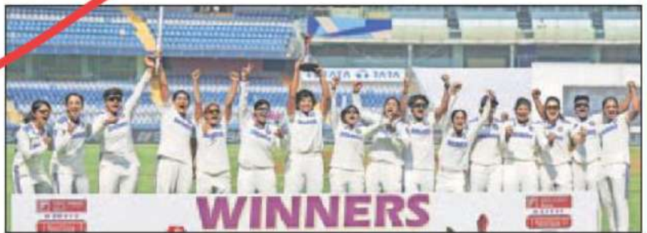
Indian players pose with the trophy in Mumbai.

After bundling out Australia for 261 in their second innings in 75 minutes, India raced to victory half an hour after lunch on the fourth day of the one-off Test as part of the multi-