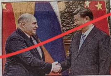
Russian PM Mikhail Mishustin with Chinese President Xi Jinping. Russia-China trade surpassed $200 billion in the first 11 months of 2023, a level the countries had not expected to reach until 2024

The border town Heihe is a microcosm of China's ever closer economic relationship with Russia. China is profiting from Russia's invasion of Ukraine, which has led Russia to switch from the West to China for purchases of a variety of products including cars. Russia, in turn, has sold oil and natural gas to China at deep discounts. Trade between Russia and China