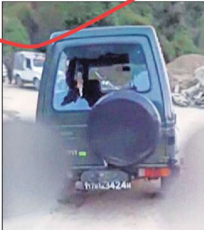
An Army vehicle after being ambushed by terrorists in Poonch district on Thursday.