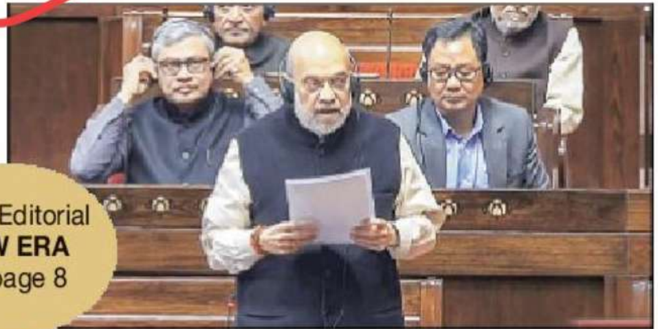
Union Home Minister Amit Shah speaks in the Rajya Sabha during the Winter Session on Thursday.

(Second) Sanhita, Bharatiya Nagarik Suraksha (Second) Sanhita and the Bharatiya Sakshya (Second) Bills will now go to the President for her assent, upon which these will become laws. Just like in the Lok Sabha, the legislations were