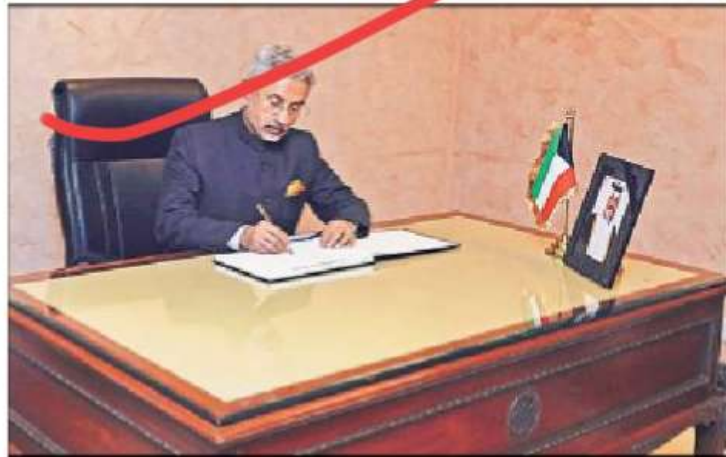
External Affairs Minister S Jaishankar during a visit to Embassy of Kuwait to convey his condolences on the passing away of Kuwait's Emir Sheikh Nawaf Al-Ahmad Al-Jaber Al-Sabah in New Delhi on Monday.

"Visited the Embassy of Kuwait in Delhi today morning to express condolences and pay my respects on the passing away of His Highness Sheikh Nawaf Al-Ahmad Al-Jaber Al-Sabah, the