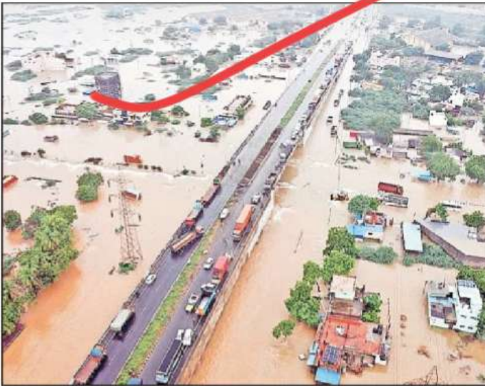
A drone view shows severe waterlogging in Thoothukudi as parts of Tamil Nadu receive incessant rainfall on Monday.

There were 39 extremely heavy rainfall reports, 33 very heavy rainfall reports and 12 heavy rainfall reports from such southern regions. Kayalpattinam in Thoothukudi district reported 95 cm, followed by Tiruchendur and Srivaikuntam (both in Thoothukudi district) reporting 69 cm and 62 cm respec-