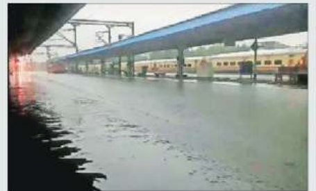
A view of an inundated railway station in Thoothukudi.

Southern Railway announced traffic suspension on the Tirunelveli-Tiruchendur section, between Srivaikuntam and Seydanganallur, as the ballast has been washed away in floods and the track is 'hanging' and water is flowing over the railway tracks.