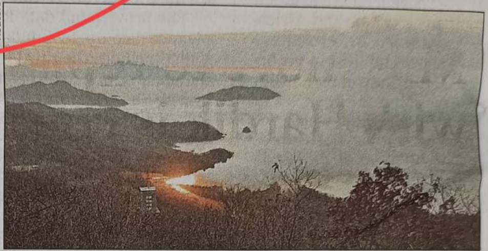
A Nov 15 photo of North Korea testing new solid-fuel engines for an ICBM

in breach of UNSC resolutions and would make the Korean peninsula less secure.