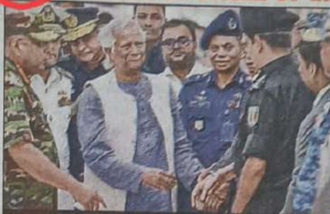
Muhammad Yunus meets top military officers on returning to Dhaka on Thursday

TWO STUDENT NETAS WHO LED STIR IN COUNCIL OF 17