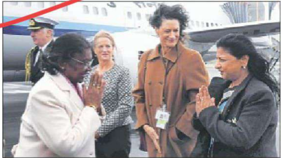
President Droupadi Murmu being received upon her arrival at the airport, in Wellington.

Earlier in the day, Murmu and Luxon reaffirmed their commitment to enhance bilateral ties, especially in educa-