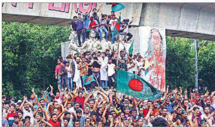
Protesters climb a public monument as they celebrate after getting the news of Prime Minister Sheikh Hasina's resignation, in Dhaka, Bangladesh on Monday.

Bangladesh founder Sheikh Mujibur Rahman's statue and smashing them with hammers in a last-minute outrage underscoring the fickleness of history -- Army chief General Waqar-uz-Zaman announced that the 76-year-old Prime Minister has resigned. After hours of uncertainty