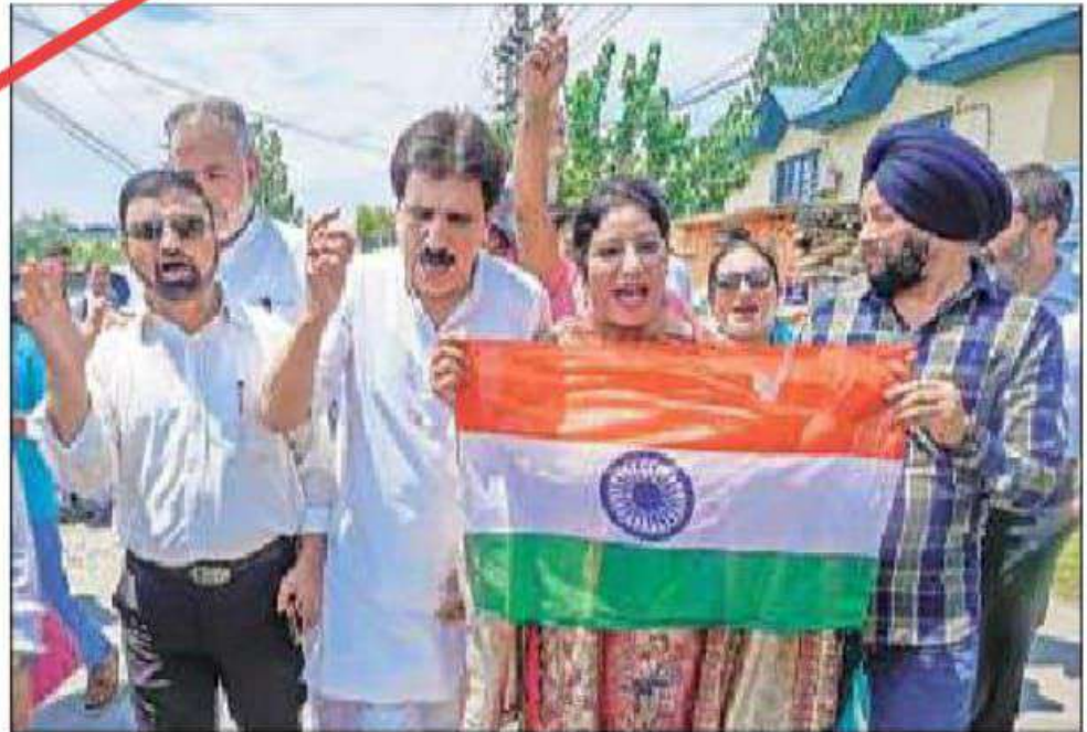
BJP members during a march to celebrate fifth anniversary of abrogation of Article 370, in Srinagar, on Monday.

Chanting slogans against the BJP, Prime Minister Narendra Modi, Home Minister Amit Shah, and in favour of state-