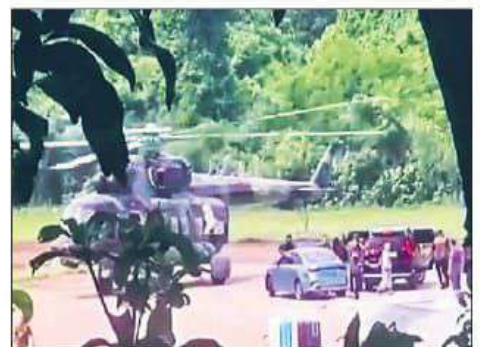
Bangladesh's Prime Minister Sheikh Hasina leaves the country in a helicopter as protesters stormed PM's palace.