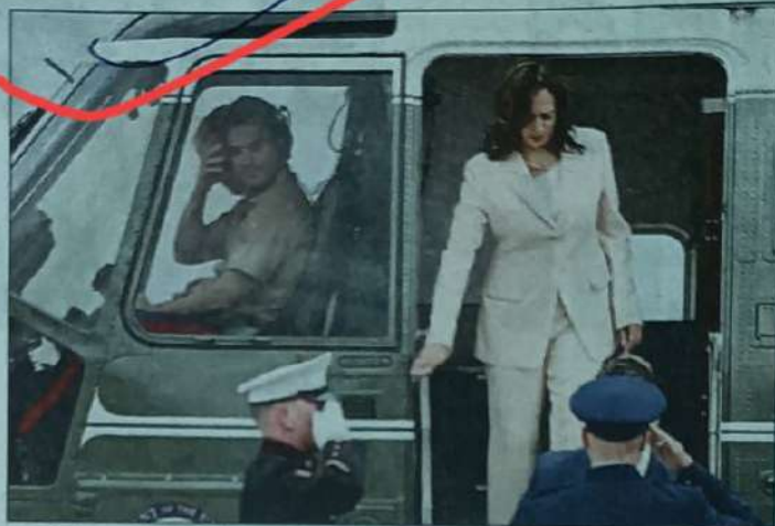
Harris boards Air Force Two to travel to Indianapolis for a keynote speech

While big donors from Hollywood and Silicon Valley account for a large portion of the windfall, the Harris campaign is also thrilled that 60% of the contributions have come from first-time donors, an indica-