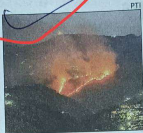
Smoke billows during a forest fire, amid heatwave conditions, in Shimla district on Wednesday

"The ongoing heat wave conditions will continue for the next 48 hours. Rain and thunderstorm activity is ex-