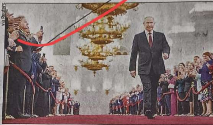
WHAT NEXT? The Russian govt has now been dissolved so that Putin can name a new PM and cabinet. One key area to watch is defence ministry. Defence minister Sergei Shoigu could become a victim of govt reshuffle

Since succeeding Prez Boris Yeltsin in the waning hours of 1999, Putin has transformed Russia from a nation emerging from economic collapse to a pariah state that threatens global security. Following the 2022 invasion of Ukraine that has become Europe's biggest conflict since WWII, Russia has been heavily sanctioned by the West. Already in office for nearly a quarter-century and the longest-serving Kremlin leader since Josef Stalin, Putin's new term doesn't expire until 2030, when he will be constitutio-