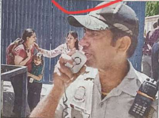
Scene outside a Delhi school on Wednesday morning

> Cops first alerted about bomb threat by DPS Dwarka at 6.10am , followed by a flood of PCR calls from across Delhi