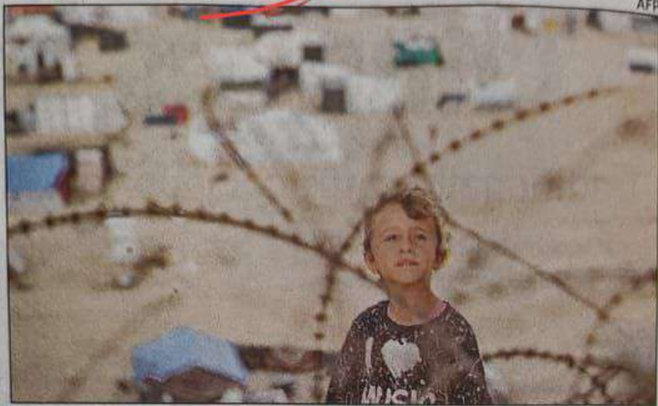
A child stands behind barbed-wire in Rafah in the southern Gaza Strip

US secretary of state Antony Blinken met with PM Netanyahu in Israel on Wednesday, his latest stop on a West Asia tour undertaken as President Biden tries to stop Israel from invading Rafah, a city in southern Gaza where Palestinians have sought shelter during the war.