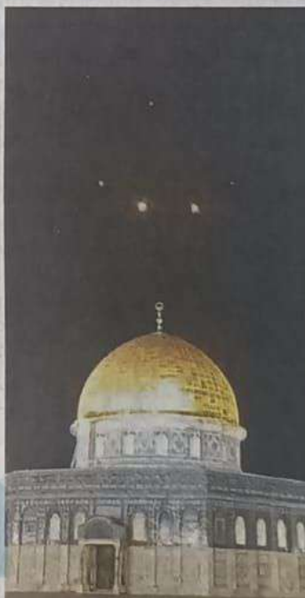
A videograb shows rocket trails in sky above the Al-Aqsa Mosque in Jerusalem on Saturday

Iran's bases and storage facilities are widely dispersed, buried deep underground and fortified with air defences, making them difficult to destroy with air strikes