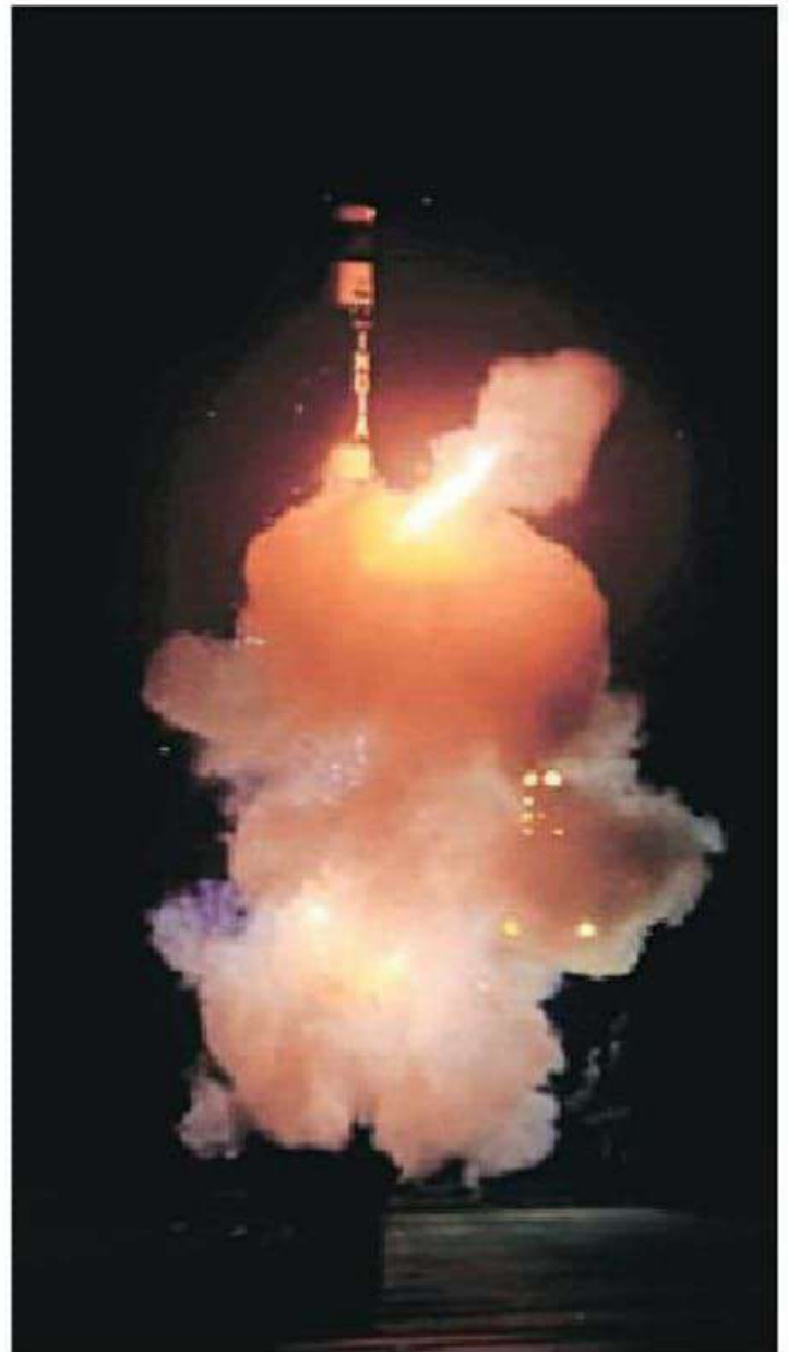
New generation ballistic missile Agni-Prime being successfully flight-tested from the APJ Abdul Kalam Island off the coast of Odisha on Thursday.

"The test met all the trial objectives validating its reliable performance, as confirmed from the data captured by a num-