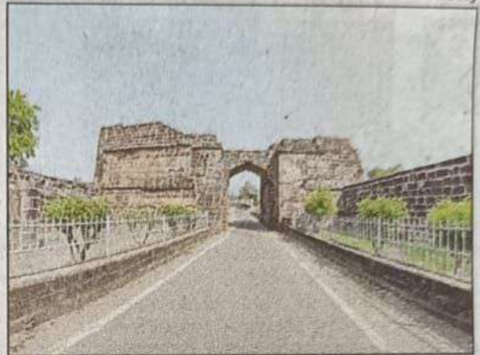
Entrance to Barabati Fort, which was built in 12th-13th century by the Ganga dynasty that ruled Odisha for over five centuries

Sources said the Barabati Fort was built in 12th-13th century by kings of the Ganga Dynasty that ruled Odisha for over five centuries. "Earlier findings from the site established Odisha's connection with south Asian countries, while folklore and legends suggest Odisha had strong maritime links with countries