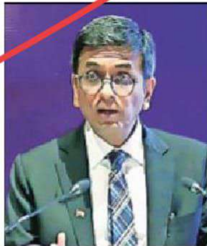
Chief Justice of India (CJI) Justice D Y Chandrachud addresses during the 20th D P Kohli Memorial Lecture on Adopting Technology to Advance Criminal Justice in New Delhi on Monday.

Delivering keynote address on 20th DP Kohli memorial lecture in the memory of founding director of the CBI, Chandrachud said Bharatiya Nyaya Sanhita (BNS), Bharatiya Nagarik Suraksha Sanhita (BNSS) and Bharatiya Sakshya Adhinyam (BSA) provide a comprehensive approach ensuring a seamless flow of information. They are intended to facilitate better co-ordi-