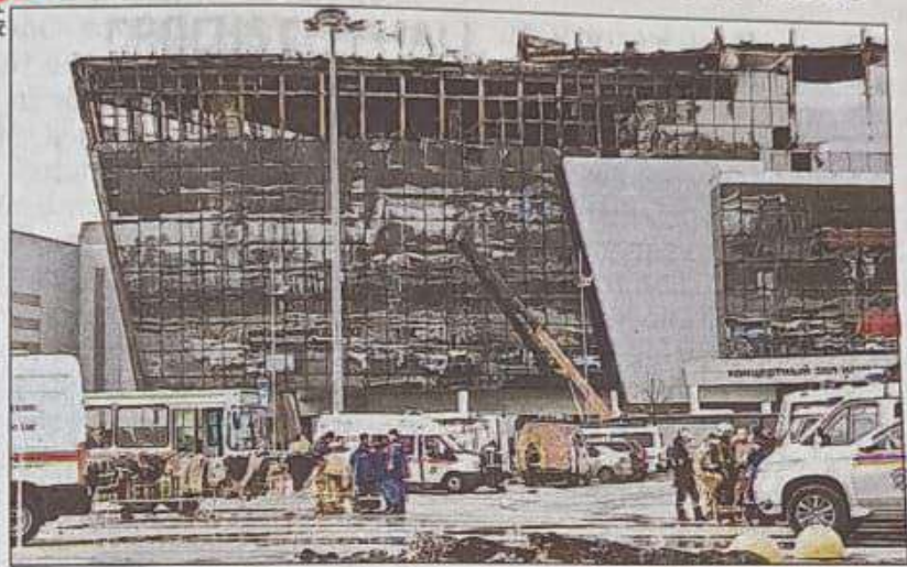
Emergency services personnel at the burnt-out concert venue in Moscow

Since President Vladimir Putin sent forces into Ukraine in 2022, the Kremlin has cast