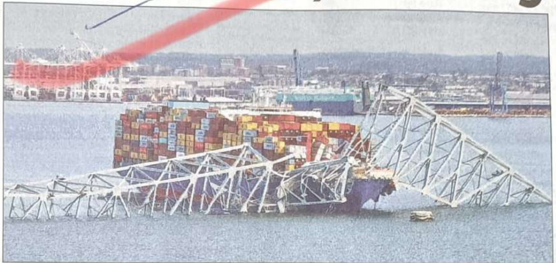
Dali crashed into Baltimore's Francis Scott Key Bridge, causing it to collapse and taking down vehicles and people. Six of the 8 workers who stopped traffic to the bridge after hearing the mayday call were missing

The entire 22-member crew of the cargo ship are Indians who alerted authorities about a "power issue" before the collision. Rescuers pulled out two survivors, one of whom was hospitalised, and were searching for more in the Patapsco river after huge metal spans of the 2.6km Francis Scott Key Bridge crumpled into the icy water at around 1.30am.