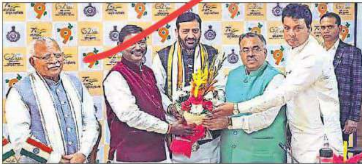
Haryana BJP President and OBC leader Nayab Singh Saini (C) being greeted by senior party leaders Arjun Munda (2nd L), Biplab Kumar Deb (R), former CM Manohar Lal Khattar (L) and others after he was chosen as the next Chief Minister in Chandigarh, on Tuesday.

Saini, the 54-year-old OBC leader, was administered oath by Governor Bandaru Dattatreya at the oath-taking