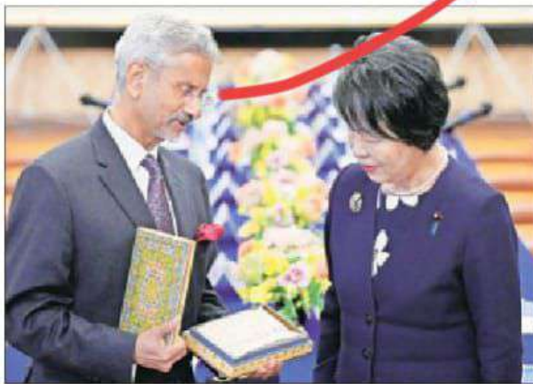
External Affairs Minister S Jaishankar gives a gift to his Japanese counterpart Yoko Kamikawa before their meeting at Iikura Guest House in Tokyo on Thursday.

"We see Japan as a natural partner in India's journey, development and transfor-