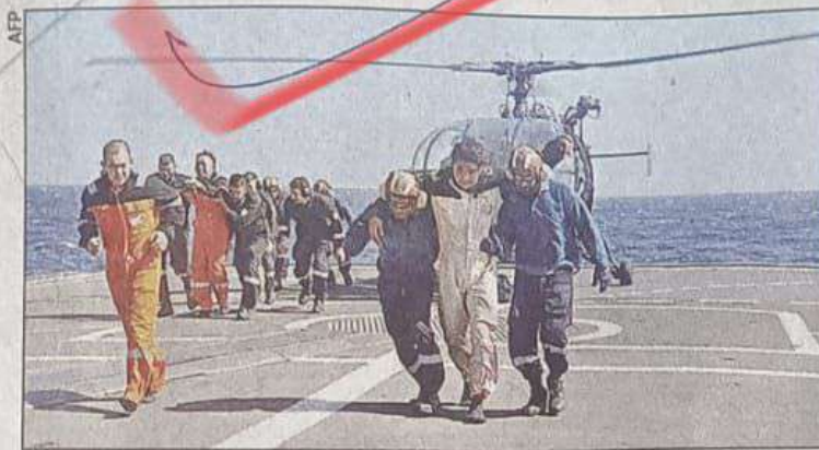
A photo released by Indian Navy shows the rescue operation of crew members of a Barbados-flagged bulk carrier in Gulf of Aden