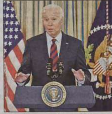
Biden's one stumble was in American Samoa, a tiny American territory, where he tied a businessman for its delegates