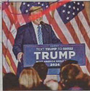
'Nikki Haley got TROUNCED last night, in record setting fashion,' Trump wrote on Truth Social after winning 14 of 15 contests

Biden again cast Trump as a threat to American democracy. "Tonight's results leave the American people with a clear choice: Are we going to keep moving forward or will we allow Donald Trump to drag us backwards into the chaos, di-