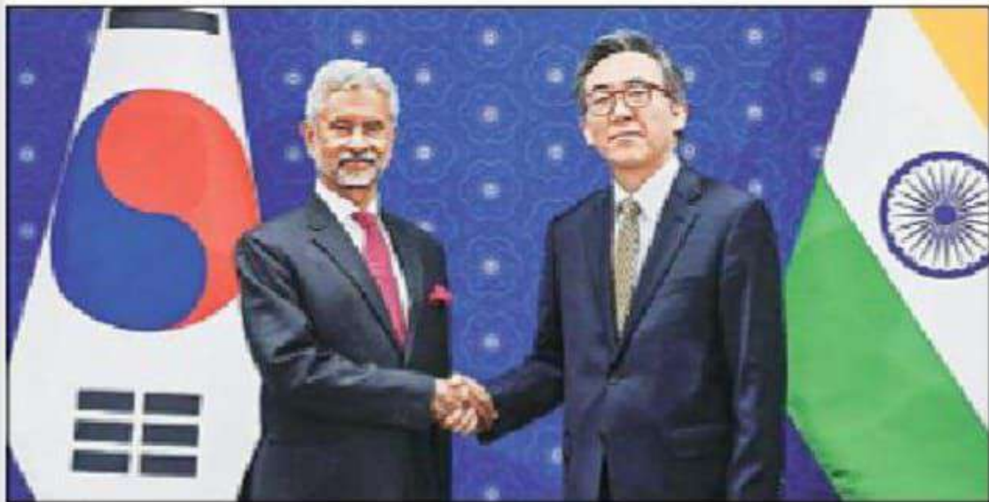
External Affairs Minister S Jaishankar with Minister of Foreign Affairs of South Korea Cho Tae-yul during 10th India-Korea Joint Commission Meeting, in Seoul, South Korea on Wednesday. (PTI)

tive discussion on cooperation in the fields of defence, science and technology and trade.