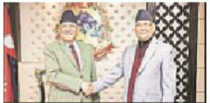
Prachanda with Sharma Oli

IN A dramatic development, Nepal's Prime Minister Pushpa Kamal Dahal 'Prachanda' on Monday reshuffled the Cabinet after terminating a nearly 15-month partnership with the Nepali Congress due to major differences between the top leadership of the two parties.