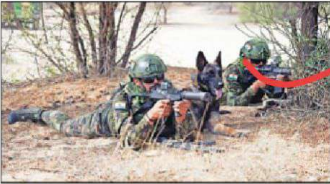
Japan Ground Self Defence Force personnel and Chetak Corps take part in the joint military exercise 'Dharma Guardian' at Mahajan Field Firing Range, on Sunday.