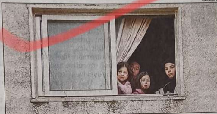
Children look out of a window during the funeral of a Palestinian teen who was killed in an air raid near Ramallah in Israeli-occupied West Bank on Sunday

The cut lines include Asia-Africa-Europe 1, Europe India Gateway, Seacom and TGN-Gulf, HGC Global Communications said. It described the cuts as affecting 25% of the traffic flowing through Red Sea. It described the Red Sea route as crucial for data moving from Asia onward to Europe and said it had begun rerouting traf-