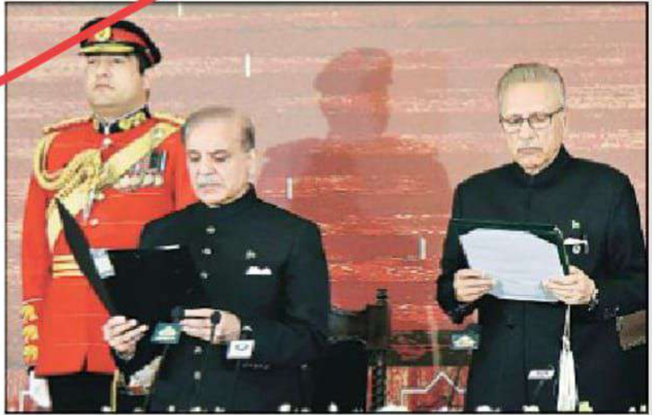
President Arif Alvi (R) administers oath of office to newly-elected Prime Minister Shehbaz Sharif at the Presidential Palace in Islamabad on Monday.

Shehbaz earlier served as Prime Minister of a coalition Government from April 2022 to August 2023 before Parliament