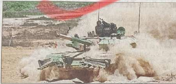
The Army will induct five of the 118 indigenous Arjun Mark-1A tanks, with 14 major and 57 minor upgrades to enhance firepower, mobility, endurance and protection, ordered for Rs 7,523 crore in Sept 2021

"The critical 'combined-arms operations' were missing. Tanks remain relevant for both offensive and defensive operations. There is no