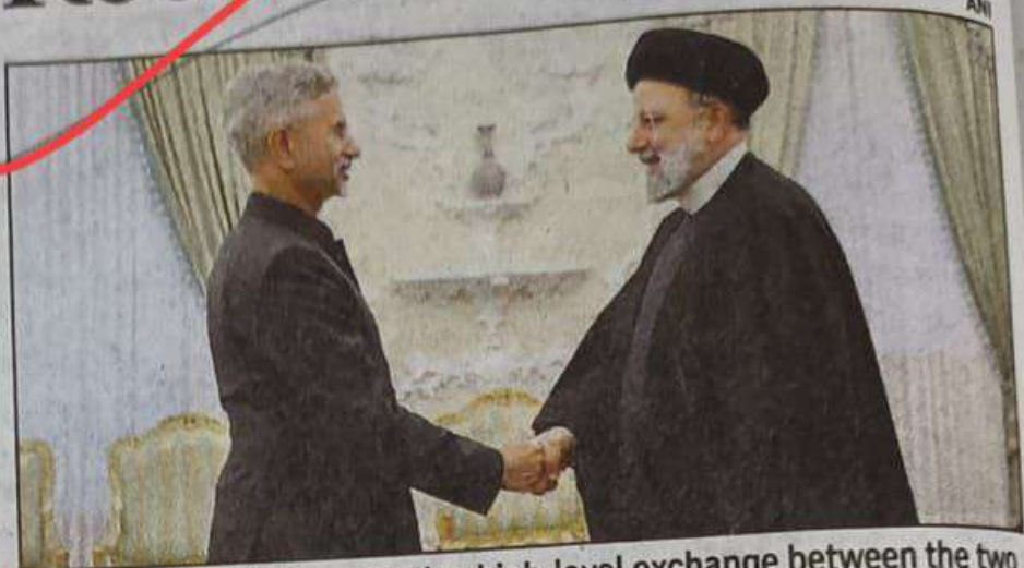
In Tehran as part of an ongoing high-level exchange between the two countries, EAM Jaishankar met President Dr Ebrahim Raisi on Monday

"Our bilateral discussion focused on the long term framework for India's involvement with Chabahar port and the INSTC connectivity project. Also spoke about threats to maritime shipping in the region. Important that this be speedily addressed," said Jaishankar in a post on X.