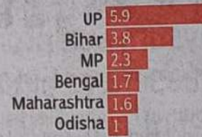
States with steepest fall between 2013-14 and 2022-23 (in cr)

year, the authors argued that India is much ahead of the target in reducing poverty in all its dimensions by half by 2030. "All 12 indicators of MPI (Multidimensional Poverty Index) have shown remarkable improvement during this period," the paper said.