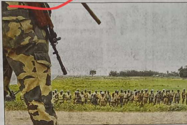
The police post is expected to facilitate the construction of a bridge over the stream, ensuring year-round connectivity to Gadchiroli district

situated in remote Etapalli taluka of eastern Vidarbha, is close to Abujmarh as well as 5.5km from Marbeda police camp in Chhattisgarh's Kanker on the other side of the border. The area is renowned as a den for top Maoist cadres, their training camps, and manufacturing units for various activ-