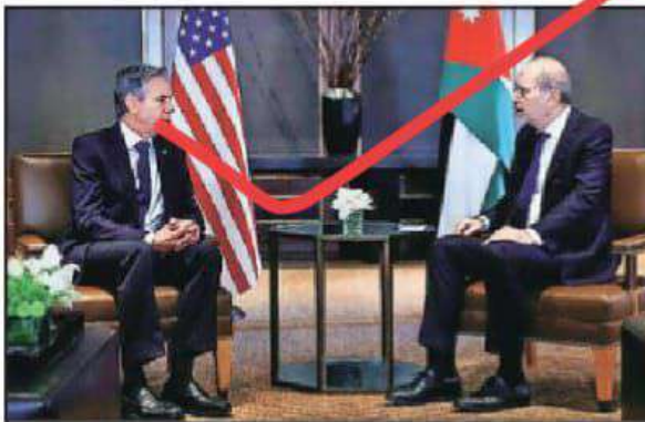
US Secretary of State Antony Blinken (left) meets Jordanian Foreign Minister Ayman Safadi in Amman, Jordan.

On his fourth visit to the region in three months, Blinken stressed the need for Israel to adjust its military operations to reduce civilian casualties and significantly boost the amount of humanitarian aid reaching Gaza while highlighting the importance of preparing detailed plans for the post-conflict future of the territory, which has been decimated by intensive Israeli