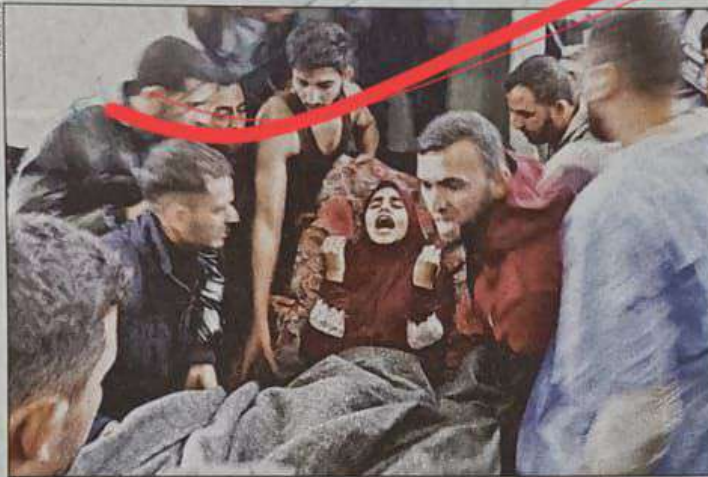
A wounded is brought into Nasser hospital in Khan Younis in Gaza Strip