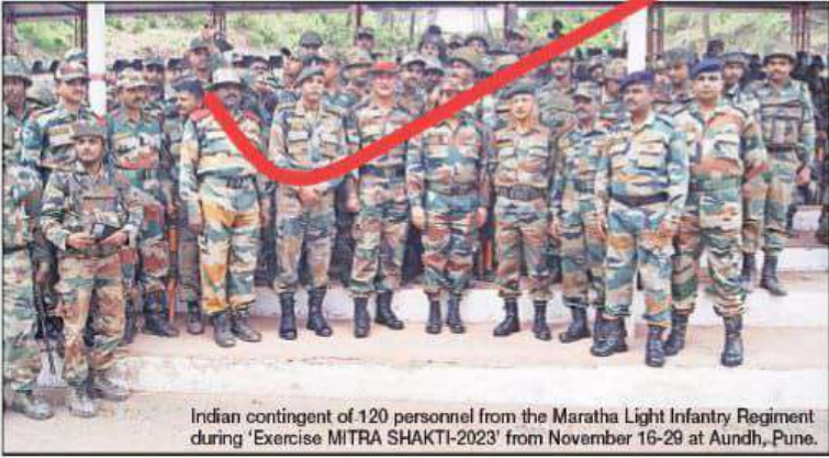
Indian contingent of 120 personnel from the Maratha Light Infantry Regiment during 'Exercise MITRA SHAKTI-2023' from November 16-29 at Aundh, Pune.

The Sri Lankan side is being represented by personnel from the 53 Infantry Division. Fifteen personnel from the Indian Air