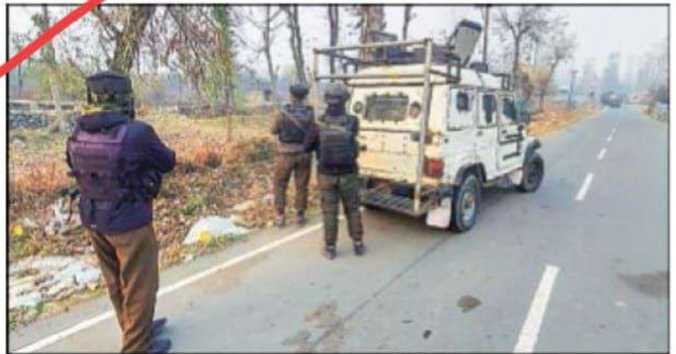
Security personnel stand guard during an encounter with militants, in Kulgam, on Thursday.