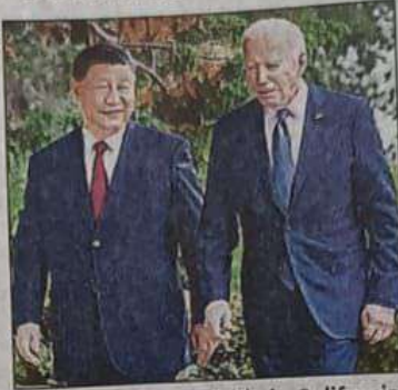
Biden & Xi at Woodside in California

Chinese accounts, the leaders repeated old talking points about Taiwan, even as Xi voiced worries that the coming election on the island could lead to talk of independence — one of the "red lines" that Chinese officials have said could force them to take military action. The leaders agreed to resume military-to-military communications, which China had cut off after Nancy Pelosi visited Taiwan last year, when she was speaker of the House. Such commitments to communicate — for transparency, and to avert collisions and crises — have been made before, and Biden made the case that military channels had to remain open to prevent potential clashes. It is unclear how Xi responded.