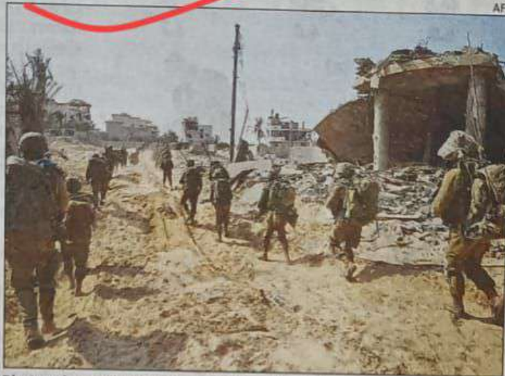
Photo released by the Israeli army on Nov 5 shows troops inside Gaza

On Monday, it said that aircraft struck 450 targets overnight and ground troops took over a Hamas compound. A one-way corridor for residents