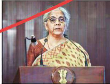
Union Finance Minister Nirmala Sitharaman speaks during a seminar, in New Delhi, on Monday.

The G20 New Delhi Leaders Declaration (NDLD), unanimously agreed to by all G20 countries, addresses some of the pressing challenges confronting the global economy and also provides policy guidance for a future built on people-focused principles and trust-based partnerships, Sitharaman said. "Even though by the end of this month, our role as G20 Presidency comes to an end, momentum must be