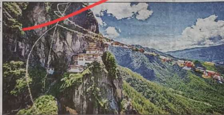
CROUCHING TIGER, HIDDEN DRAGON: New Delhi is a stakeholder in the sensitive Doklam dispute on the Bhutan-China-India tri-junction

of the sensitive Doklam dispute between China and Bhutan and the determination of the Bhutan-China-India tri-junction in which India is also a stakeholder. India has repeatedly reminded China that, as per a 2012 understanding, the tri-junction boundary points between India, China and third countries has to be finalised in consultation with the countries concerned.