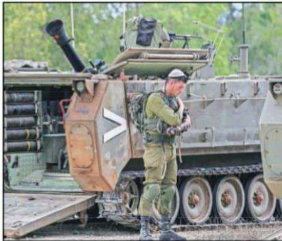
An Israeli soldier prays next to a tank at a staging ground near the Israeli Gaza border, southern Israel on Monday.

Since the early 1980s, Iran has maintained support for anti-Israeli militant groups and operations. The Islamic Republic has publicly pledged millions of dollars of annual support to groups and provides advanced military training for thousands of Palestinian fighters at Revolutionary Guard and Hezbollah bases in Iran and Lebanon