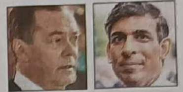
Russian ex-President Dmitry Medvedev on Sunday said any UK soldiers training Ukrainian troops in Ukraine would be legitimate targets for Russian forces

Sunak: No plan to send military trainers to Ukraine