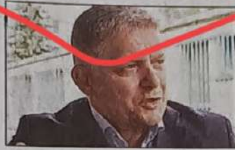
Fico has vowed to pull out Slovakia military support for Ukraine. 'People in Slovakia have bigger problems than Ukraine,' he said

Public and exit polls predicted a tight race but in the end, Fico won relatively big after his campaign attracted voters who favoured the far-right. With no party winning a majority of seats, a coalition government will need to be formed. The president traditionally asks an election's winner to try to form a government, so Fico is likely to become prime minister again. He served as prime minister in 2006-2010 and again in 2012-2018. Fico said he was ready to open talks with other parties on forming a coalition government as soon as President Zuzana Caputova asks him. Caputova said she will do it on Monday. "We're here, we're ready, we've learned something, we're more experienced," he said.