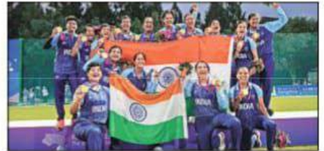
Indian players pose for photos after winning the gold medal in the women's cricket event after defeating Sri Lanka at the 19th Asian Games, in Hangzhou, China.