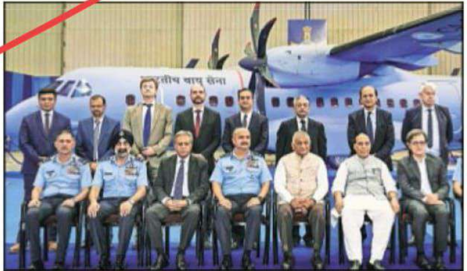
Defence Minister Rajnath Singh with Union MoS for Civil Aviation V K Singh, IAF chief Air Chief Marshal V R Chaudhari and others poses for a group photo during formal induction of C-295 MW transport aircraft into IAF at the Hindon Air Force Station.

The IAF chief had on September 13 received the first of the 56 C-295 transport aircraft (Contd on page 4)