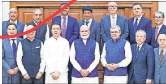
Prime Minister Narendra Modi with Union IT Minister Ashwini Vaishnaw, Mos Jitin Prasada and executives after chairing the Semiconductor Executives' roundtable ahead of the Semicon India, in New Delhi on Tuesday.