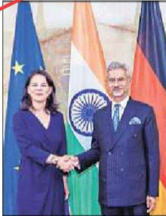
External Affairs Minister S Jaishankar with German Foreign Minister A Baerbock at a meeting in Berlin.

Recalling Prime Minister Narendra Modi's visits to Russia and Ukraine, he said the Indian leader has said in Moscow and Kyiv that this is not an era of war. "We don't think you're going to get a solution out of the battlefield. We think you've got to negotiate... If you want advice, we are always willing to give it..." he said, adding countries have differences but