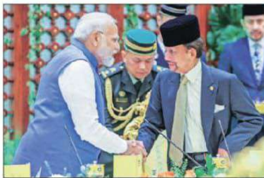
Prime Minister Narendra Modi and Sultan of Brunei, Haji Hassanal Bolkiah shake hands during PM Modi's recent visit to Brunei.

The Indo-Pacific region covers the Indian Ocean and the western and central Pacific Ocean. Indo-Pacific region is world's fastest growing area and obviously has the maximum interest of USA and China. The region is home to about 55% of the world population and accounts for 60% of the global GDP. Economically, it is the fastest growing region which accounts for two third of global economic growth.