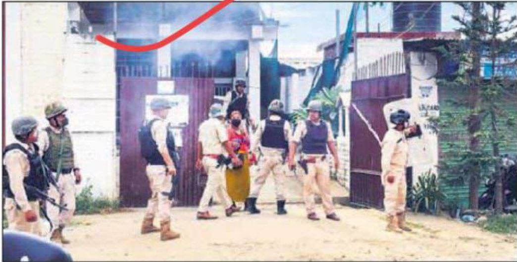
Security personnel stand guard during students' protest, in Imphal, on Tuesday.

Students protest demanding restoration of peace in State