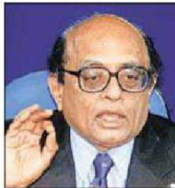
Minister Jitendra Singh extended his condolences to