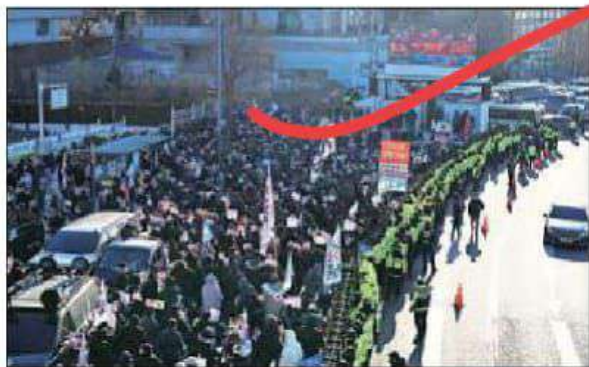
Supporters of impeached South Korean President Yoon Suk Yeol stage a rally to oppose a court having issued a warrant to detain Yoon, as police officers stand guard near the Presidential residence in Seoul, South Korea, on Friday.

The country's anti-corruption agency said it withdrew its investigators after the presidential security service blocked them from entering President Yoon Suk Yeol's residence for hours due to concerns about their safety. The agency expressed "serious regret about the attitude of the suspect,