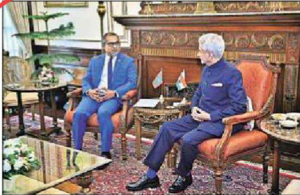
External Affairs Minister S Jaishankar with Minister of Foreign Affairs of Maldives Abdulla Khaleel during a meeting in New Delhi on Friday.

"I see that the framework to promote the use of local currencies for cross border transactions has been signed,"