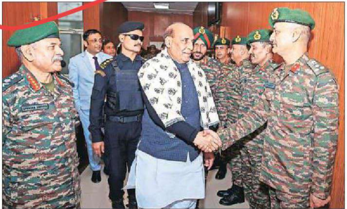
Defence Minister Rajnath Singh with Chief of Army Staff (COAS) General Upendra Dwivedi and others during his visit at Army War College, at Mhow, in Indore district of Madhya Pradesh on Monday.

"Our defence exports, which were around Rs 2,000 crore a decade ago, have crossed the record figure of Rs 21,000 crore today. We have set an export target of Rs 50,000 crore by 2029," Singh said. He said Made-in-India equipment is being exported to other countries. Singh mentioned