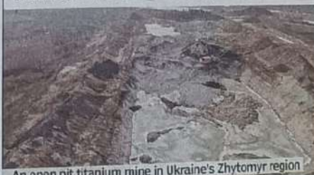
An open pit titanium mine in Ukraine's Zhytomyr region

About 40% of Ukraine's metal resources are reportedly now under Russian occupation. Russia occupies at least two Ukrainian lithium deposits — one in Donetsk and another in Zaporizhzhia