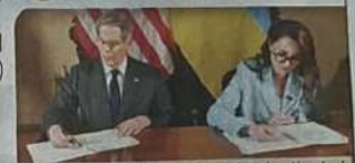
Scott Bessent & Yulia Svyrydenko sign the deal