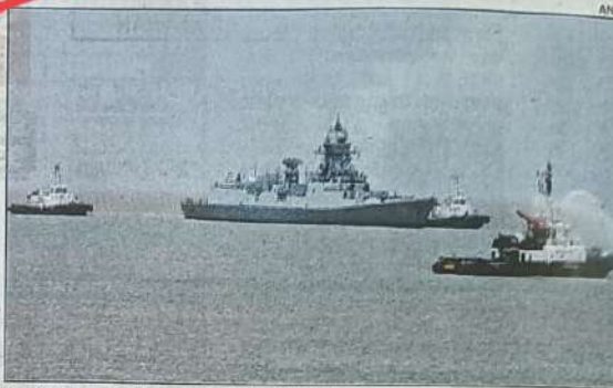
Navy's latest indigenous guided missile destroyer INS Surat arrives at Hazira Port for the first time on Gujarat Foundation Day, in Surat on Thursday. Navy has deployed several warships in the Arabian Sea

Amid the heightened tensions with Pakistan, IAF is undertaking long-range day and night fighter sorties, while also keep-