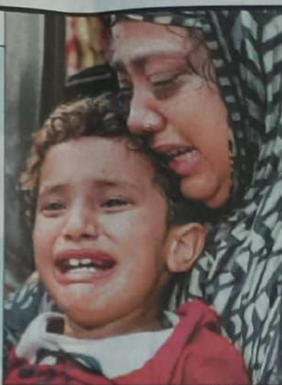
An Indian woman and her child, a Pak passport holder, break down after not being able to cross over to Pak at Attari-Wagah border as Pak refused to open the gates Thursday